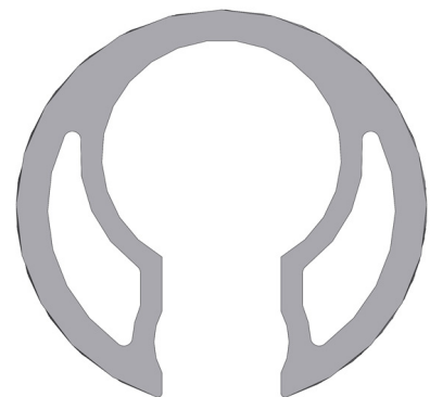
Tube Cross Section